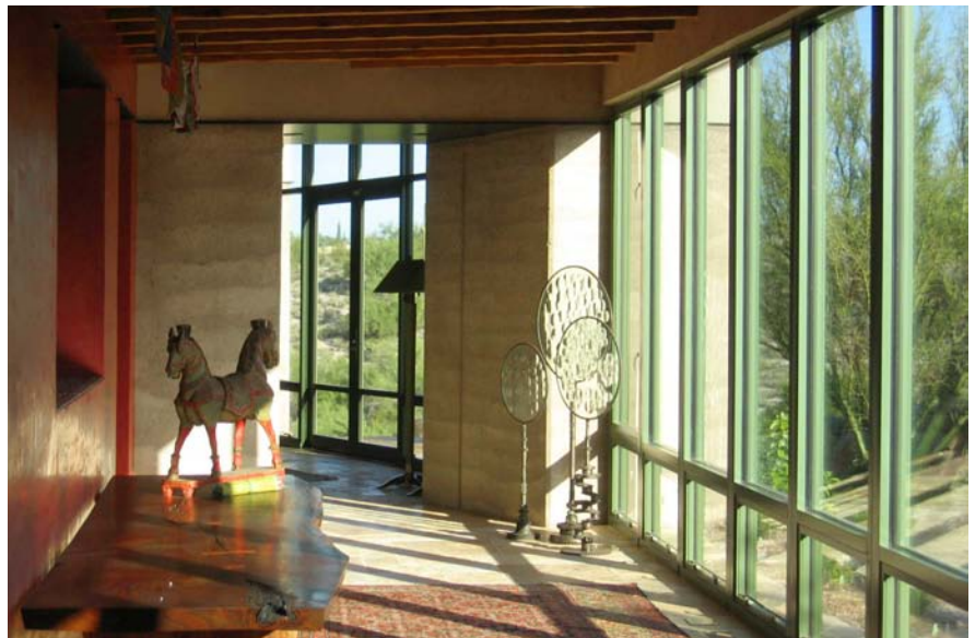
Suby Bowden + Associates